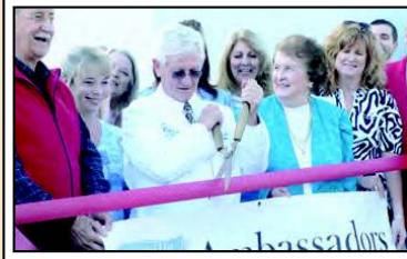
Successful Ribbon Cutting